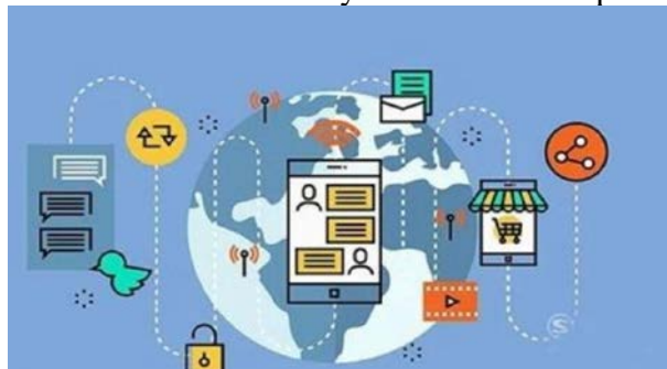
Figure 1 E-commerce marketing profile

On the whole, the strategy of e-commerce is mainly to transform the traditional business activities of enterprises effectively, so that the business activities of enterprises gradually develop towards the direction of information and intelligence. In order to ensure the successful transformation of e-commerce, managers need to analyze the key success factors deeply.[1]The key success factors are that the relevant staff should combine the current development situation of the enterprise and the competitiveness of the enterprise in the market, objectively integrate the development opportunities and development challenges faced by the enterprise, and make a comprehensive analysis and summary of the development advantages and disadvantages of the enterprise in the current market competition, so as to obtain the key success factors for the implementation of the enterprise's e-commerce strategy. After the initial identification of the key success factors, it is also necessary for the relevant staff to make clear, through the process of discussion and analysis, whether the identified key factors are in line with the current strategic development objectives of the enterprise, so as to continuously improve the development level and quality of the enterprise. so as to ensure the orderly conduct of enterprise e-commerce strategy.